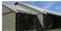
2 bedroom (602 Albert Road, Unit C) $550, plus utilities.

Please contact Marlyin Touchie for more information @ 726- 6201.