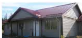
3 bedroom (427 Wya Road) $675, plus utilities