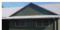
2 bedroom (609 Albert Road, Unit A) $525, plus utilities