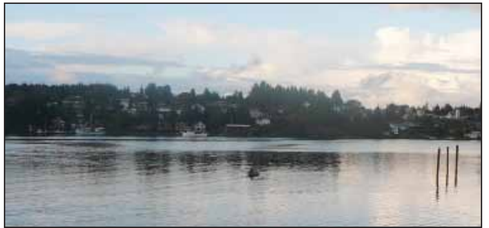
Morning row on a spectacular fall day.