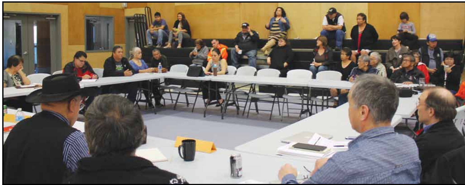
The All Candidates Night brought some lively conversation: details on pages 2,3,4, and 5.

The new Legislature will be sworn in before the end of the month; a date has not yet been set.