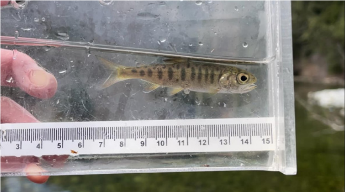
2024 Biosphere Research Award Recipient